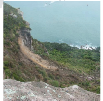
Before (left) and after.