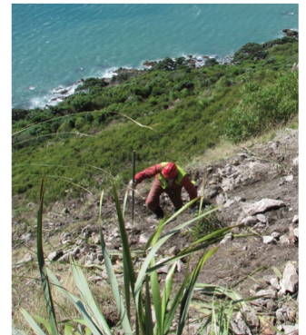
Staff chased down the loose rock remains to ensure the safety of people using the track below.