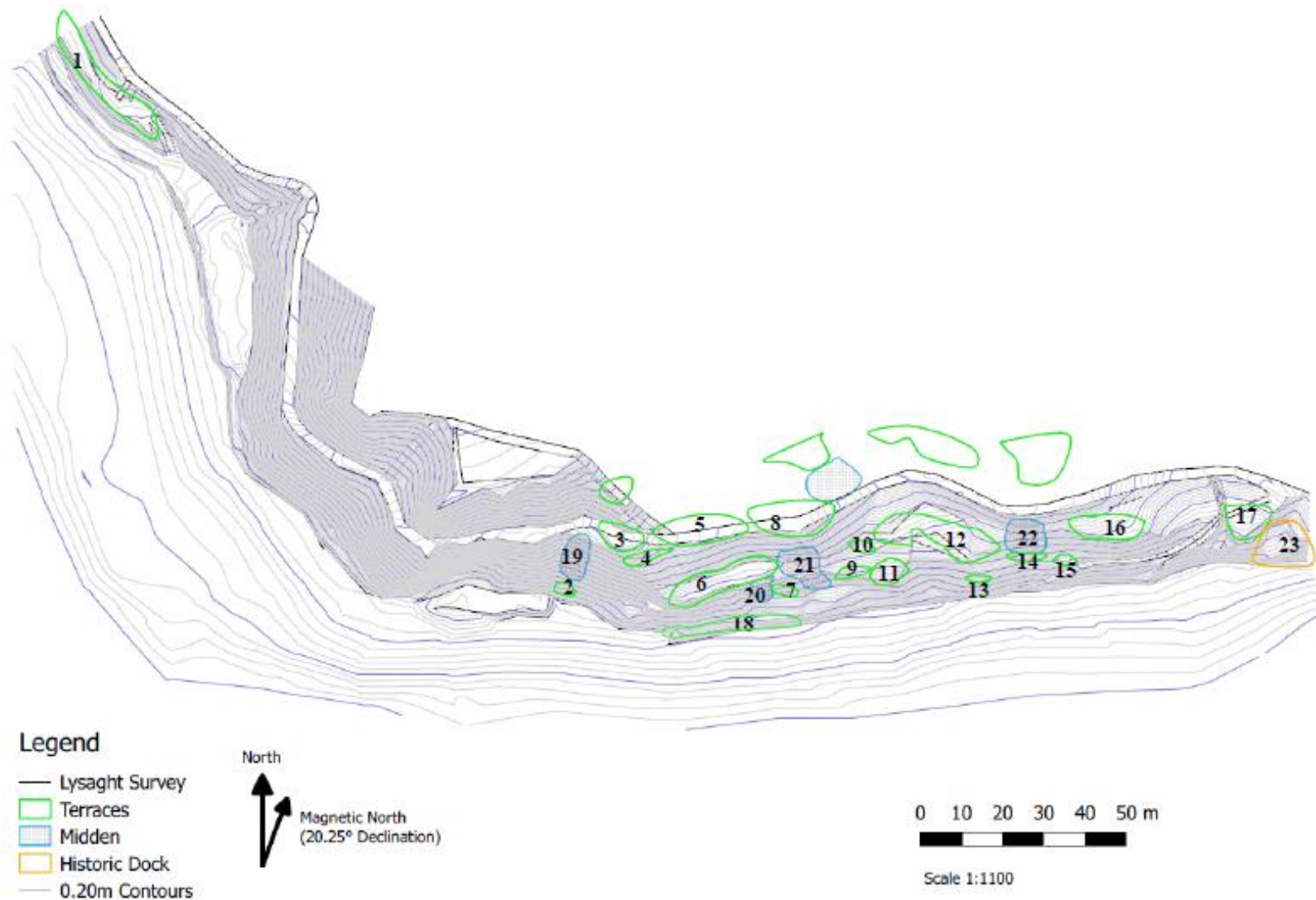
Archaeological features recorded March 2018, Mauao Historic Reserve overlaid on contour survey data provided by Tauranga City Council