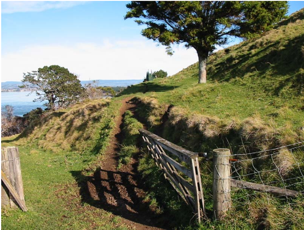
Figure 21. Stock tracking onto archaeological feature caused by gate location.

Previous management plans have presumed that the purpose of grazing has been to provide for public recreational use and this philosophy has dictated stock management often to the detriment of archaeological features. Stock grazing must be considered a strategy primarily for the management of archaeological features and stock management plans should be devised to provide the greatest protection to those features.