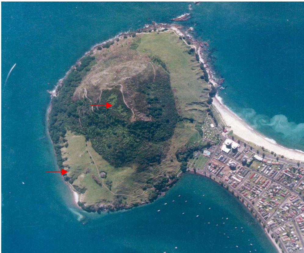
Figure 5. Aerial view of Mauao showing location of Summit Pa (top arrow) and Western pa (bottom arrow).

The Western Pa survives in very good condition. Stock tracking erosion has occurred in some areas but these are now largely stabilised. The presence of a post and wire fence on the northern side of the pa is the only aesthetic detraction and should be relocated.