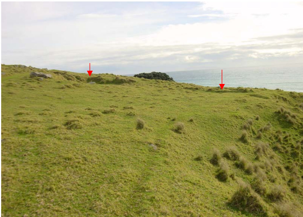
Figure 15. Earthwork features (Terrace feature (left) and pit feature (right)) often attributed to a military camp on the eastern slopes of Mauao

While research carried out for this report was by no means exhaustive no creditable archival reference to post Te Ranga military camp or 'Whitmore's Camp' was found in available archives. H T Clarke (Civil Commissioner) refers to a ship carrying Colonial Forces and the Arawa Contingent moored off Mauao on 13 April 1869. Whitmore arrived in Tauranga several days later. It is a reasonable suggestion that the troupes camped at Mount Maunganui' away from the hotels of Te Papa, prior to their departure along the beach to Matata. Ryan and Parham write that 'The force assembled at Mt Maunganui, and the nearby town of Tauranga was declared out of bounds'. 39 The probably location of a temporary camp would have been on the harbour side where two prolific springs would have provided drinking water. Whitmore and the troupes left Tauranga on 17 th April with hardly enough time to construct stone steps. 40