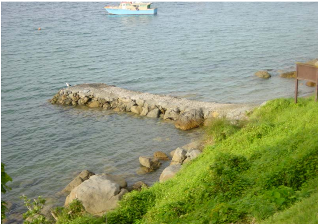
Figure 14. The Stone Jetty.

The stone jetty is recorded as an archaeological site and is protected under the provisions of the Historic Places Act. Any proposed maintenance or modification of the jetty will require an authority from the New Zealand Historic Places Trust.