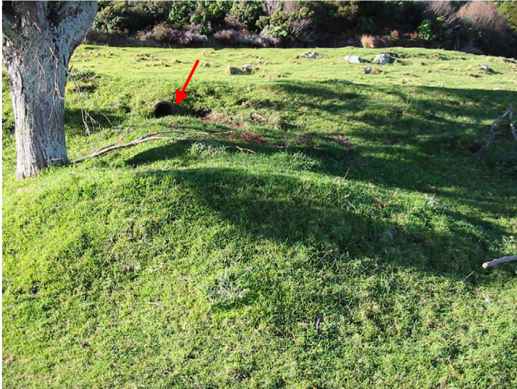
Figure 29. Storm water pipe directing mobilized archaeological deposits onto archaeological features.