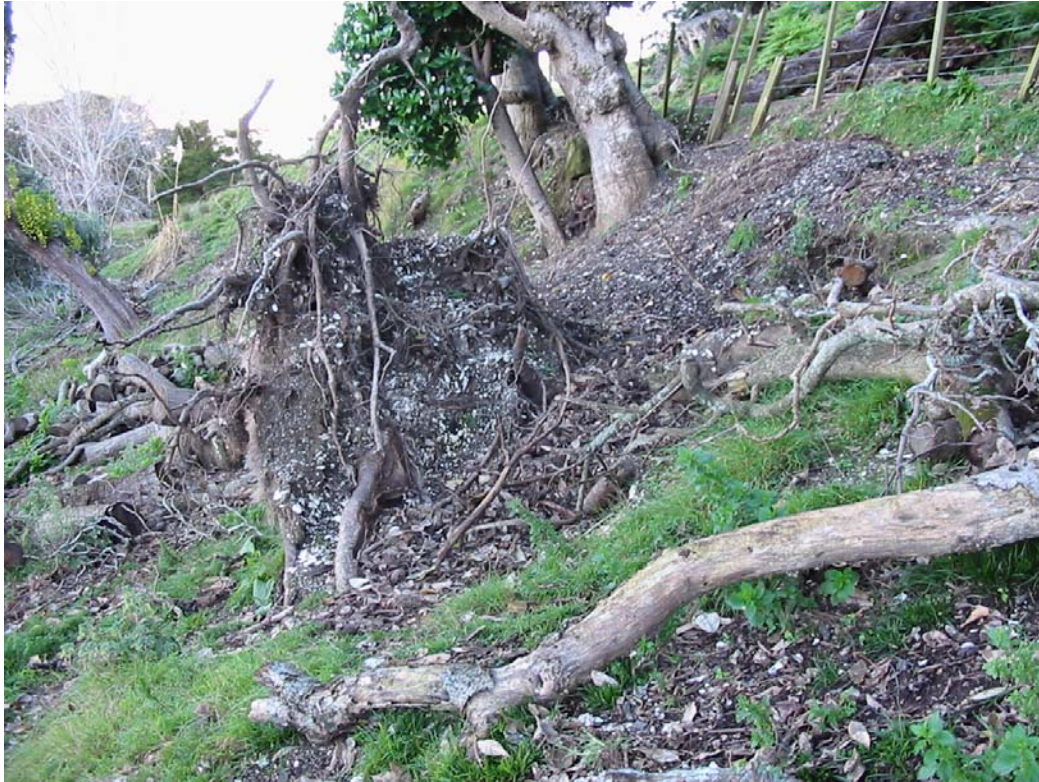
Figure 19. Archaeological deposits exposed in the roots of wind-throw tree.