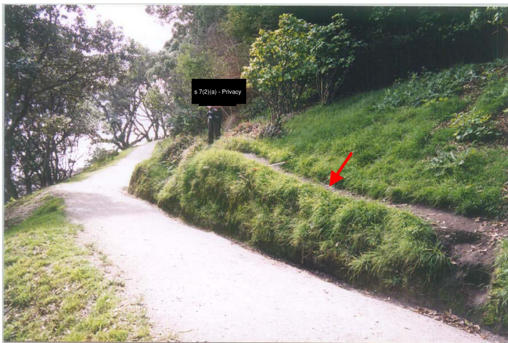
Figure 25. An example of a child's desire line above the base track.

Desire lines are preferred pedestrian routes or short cuts diverging from the formalized track network. They are generally formed to access particular objects such as reserve furniture or geographical features such as the summit or a look out point. Careful design of walking tracks can considerably reduce the potential for erosion and damage to archaeological sites from the formation of desire lines. Modifications to existing tracks on Mauao may be required in order to remedy existing desire lines currently causing damage to archaeological features.