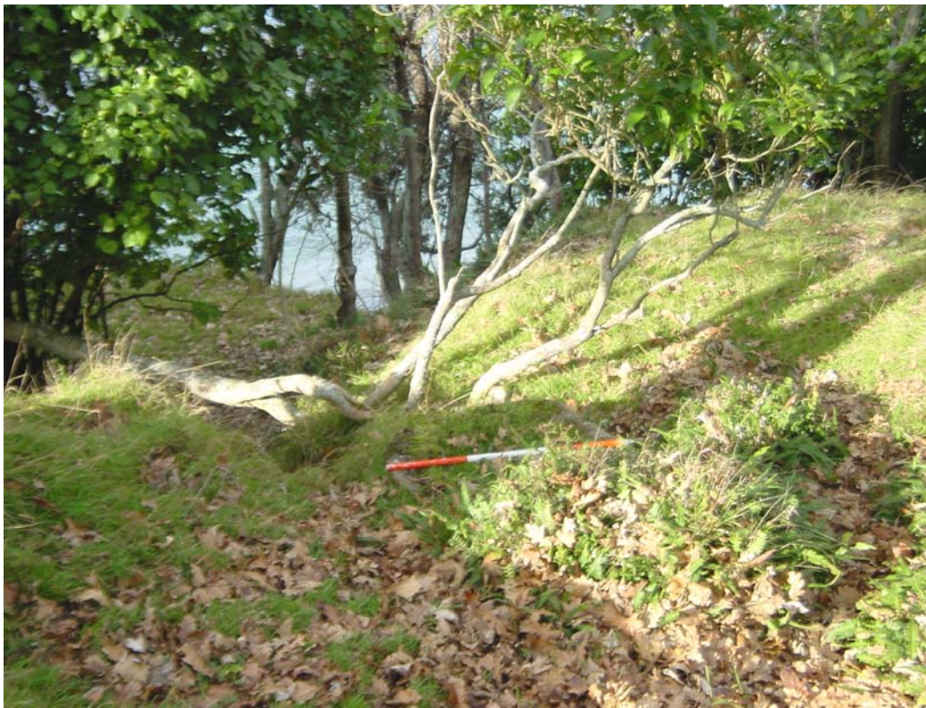
Figure 13. Photo scale lying on concrete tank cap above iron jetty.