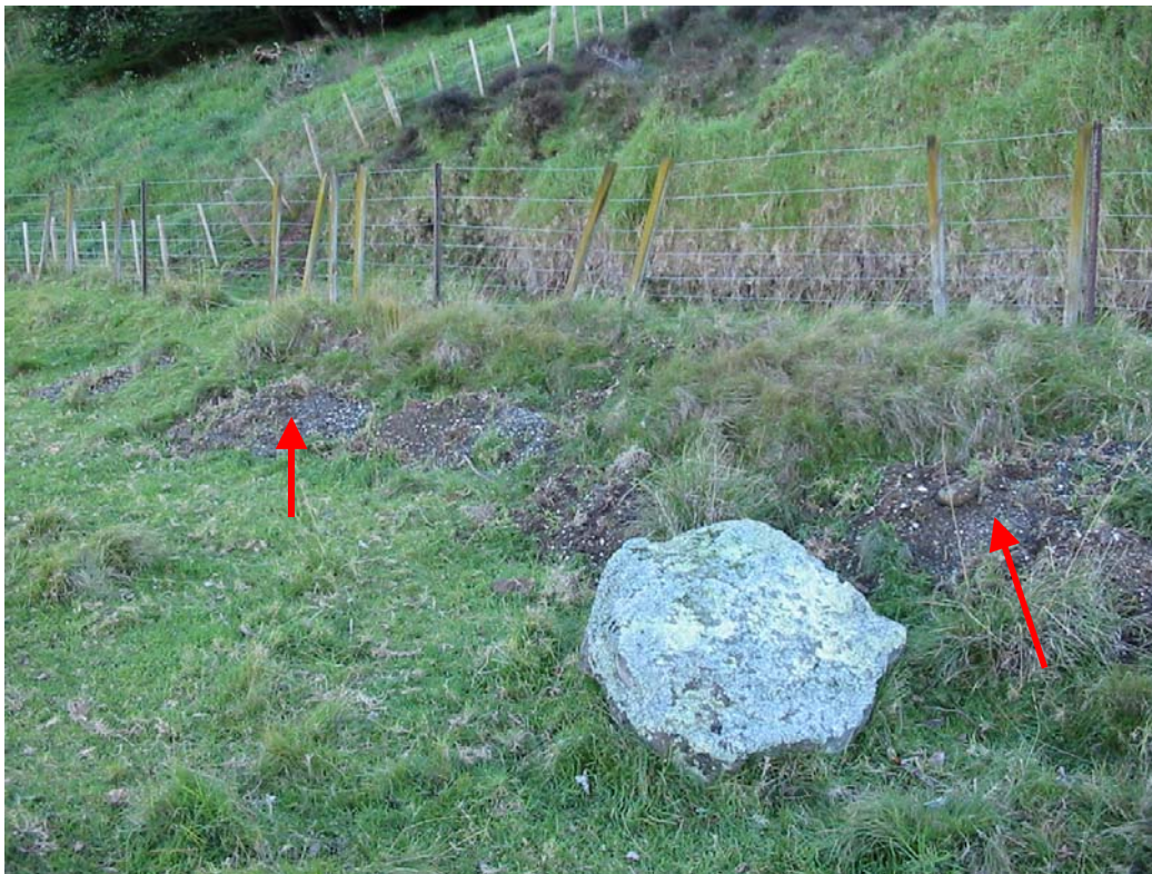
Figure 28. Material removed from storm water drains on 4WD track and deposited onto archaeological features.

The clearance of open drains by spade or machine has also contributed to this archaeological pollution as material is physically removed from the drain and redeposited above or below the track onto archaeological features.