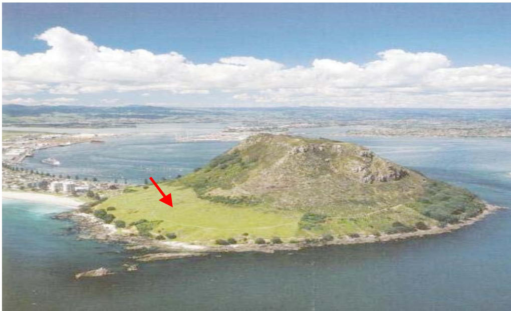
Figure 6. View of eastern slopes in pasture.