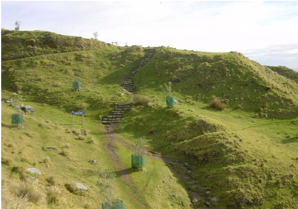
Figure 16. The stone steps ascending a gully on the eastern side of Mauao.

Adams, an early resident at the Mount, believes the steps were built by the militia for their own purposes i.e. carrying stores from Pilot Bay up to their camp site 42 ,