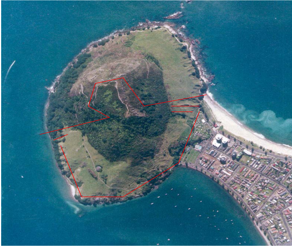
Figure 8. Aerial view of Mauao showing probable location of Maunganui Pa defensive lines.

The enormous scale of Maunganui pa would have required an exceptional degree of social and political organisation in its construction, maintenance and defence. The use of space within the pa, evidenced by the distribution and function of archaeological features, reflects this degree of organisation making Maunganui one of the most remarkable pa in New Zealand.