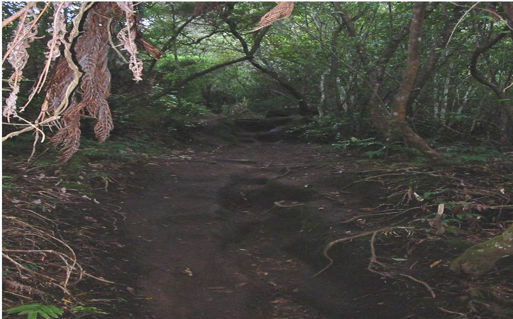
Figure 24. Damage to occupation terraces from foot traffic and subsequent storm water run off.

While it is important to formalize and direct the majority of this traffic it is equally important that visitors are not segregated from the archaeological cultural / landscape. Public access to the landscape should not be seen as incompatible with its preservation.