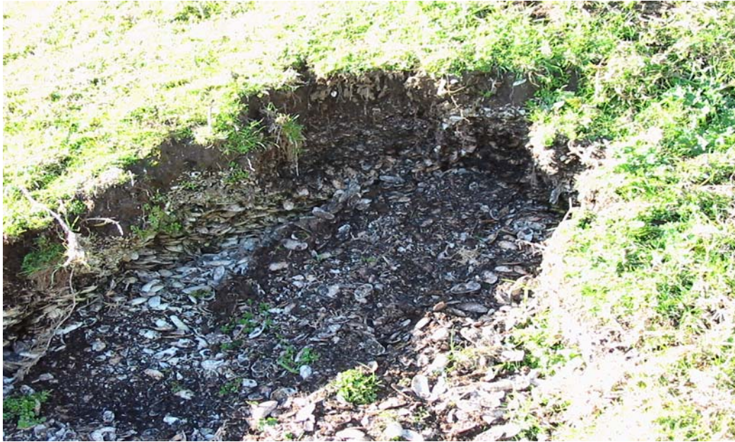
Figure 2. Pest damage to shell mound showing stratified layers of whole, crushed and burnt shell.