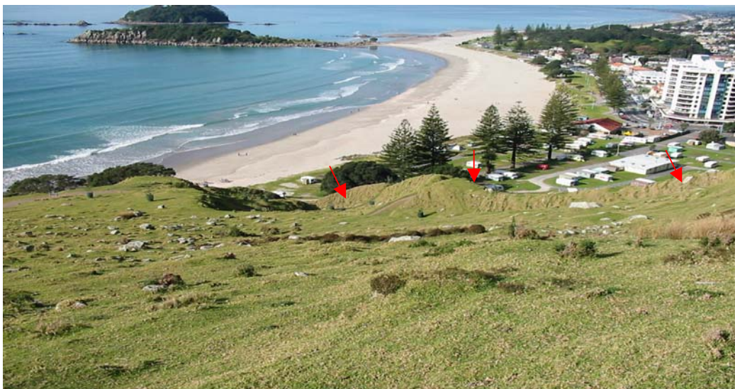
Figure 9. Probable location of the eastern defensive boundary of Maunganui Pa.

The enormous scale of Maunganui pa would have required an exceptional degree of social and political organisation in its construction, maintenance and defence. The use of space within the pa, evidenced by the distribution and function of archaeological features, reflects this degree of organisation making Maunganui one of the most remarkable pa in New Zealand.