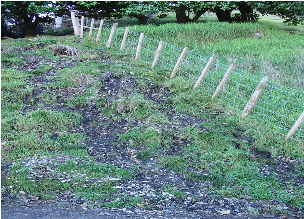
Figure 22. Stock damage to archaeological features caused by fenced off middens.

The most recent damage to archaeological features on Mauao has resulted from the construction of post and wire fences around several of the large shell mounds on the southern slopes. While the intention was to keep stock off the eroding shell the new fences have simply moved the problem off the midden and onto more archaeologically sensitive features. Consequently sheep tracking along the fence perimeter has caused significant damage to archaeological features in several areas. 49