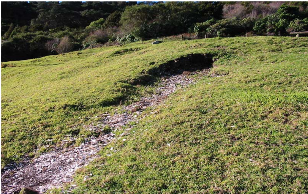
Figure 31. Erosion to midden mound caused by rabbit burrowing.

Grazing creates a favorable habitat for rabbits. Observations carried out between January and July 2003 has indicated that rabbits are currently the most significant threat to the stability of archaeological features on Mauao. Burrows on shell midden mounds and terrace risers are extensive and the initial ‘wound’ is often made worse by subsequent stock activity.