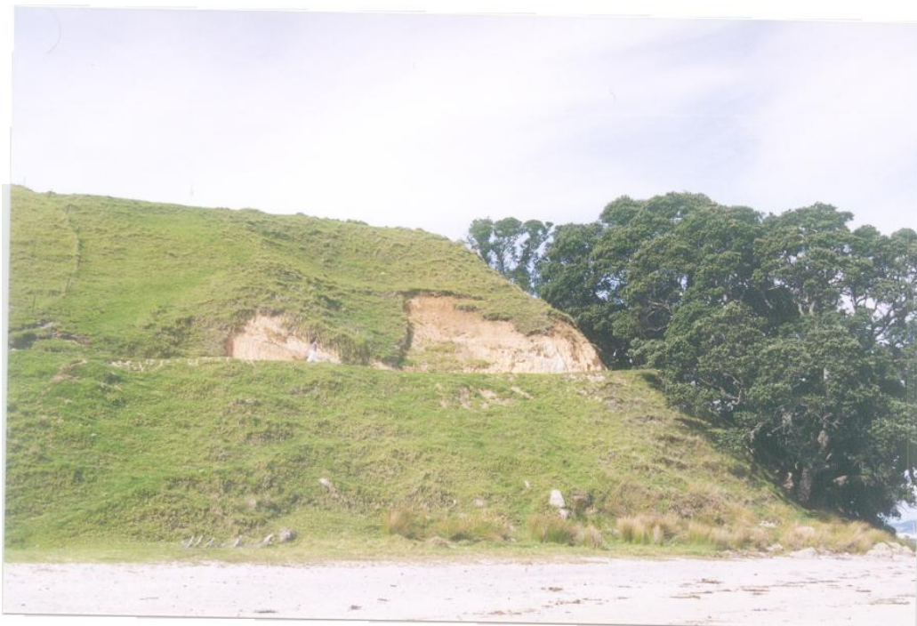
Figure 23 Erosion caused by base track construction threatening to damage archaeological features above.

Equally extensive is the gulch at the head of a spring gully on the western slopes caused by overflow from the western reservoir.