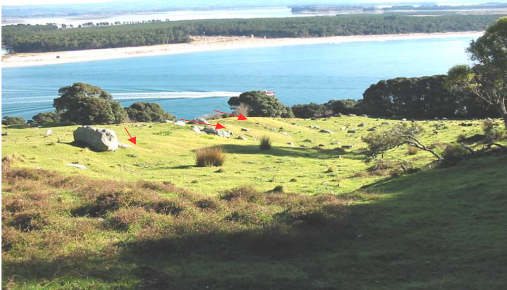
Figure 7. Probable location of the western defensive boundary of Maunganui Pa. Arrows point to large shell mounds on south side of gully.

provides evidence of the existence of this super pa. Visible archaeological features on the southern side of Mauao terminate relatively abruptly at two points on the eastern and western sides. The western boundary is defined by a gully extending from the rocky shore up the talus slopes to a section of near vertical slope angle. The defining archaeological features on the southern inner edge of this gully are a row of large shell mounds creating an elevated inner bank. Few archaeological features are found north of this gully where the gently sloping ground changes rapidly to steep terrain.