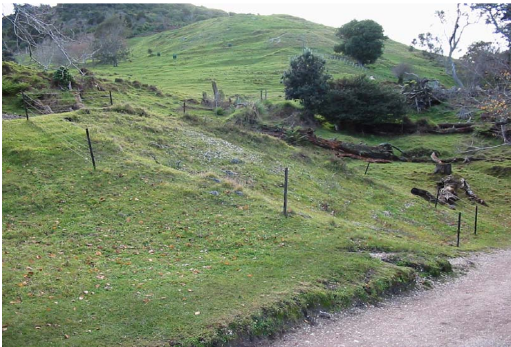
Figure 3. A quarried shell midden mound beside the base track.

The vast shell middens on Mauao were quarried and used as aggregate soon after the first Europeans settled in the area. Mission records of the late 1830s indicate shell was sourced from Mauao for burning into lime. 19 Captain Carmichael (first Harbour