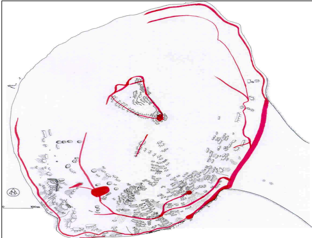
Figure 30. Plan of archaeological landscape with walking tracks, roads and areas of significant disturbance shown in red.