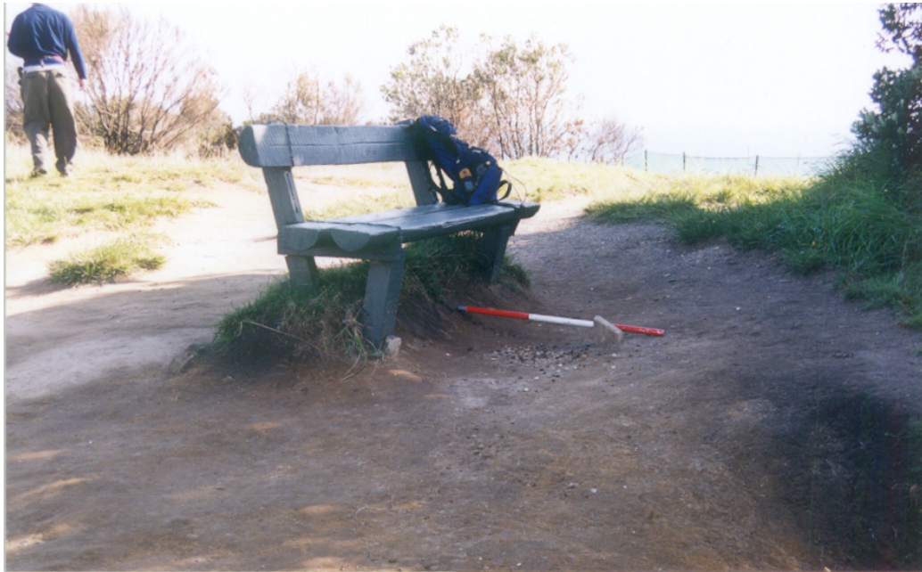
Figure 26. Damage to archaeological feature on the summit pa caused by foot traffic accessing reserve furniture