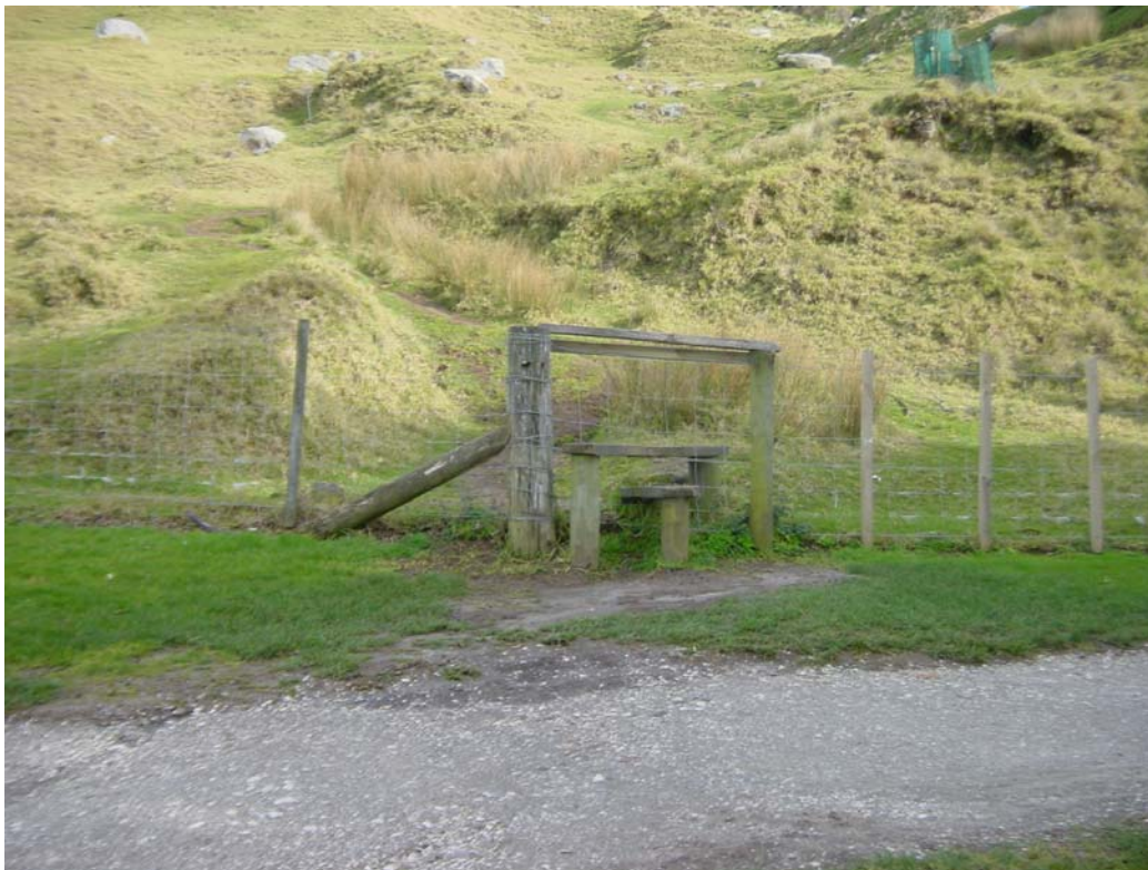
Figure 27. Installation of stiles encourages concentrated informal tracking and consequent damage to archaeological features.