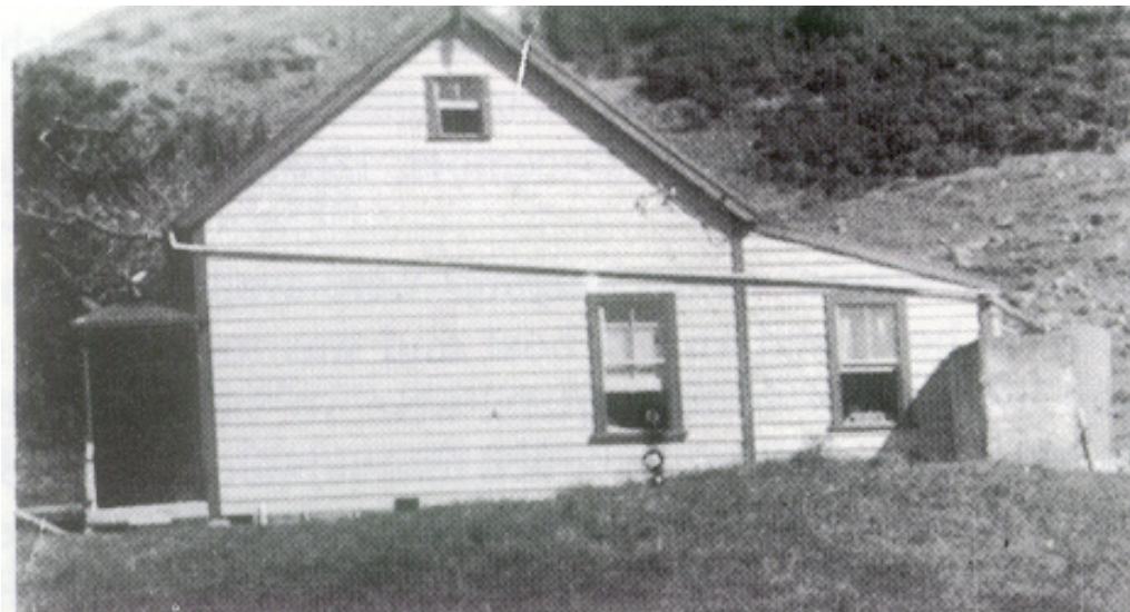
Figure 17. The second Pilot cottage as it was in the 1920s.

The first Pilot house was constructed in 1866 - 1867 on a prominent spur extending east from the base of Mauao. According to the dairies of Carmichael it was poorly constructed from inferior materials. Notable features included shell paths and an encircling ditch. 45 The function of the ditch is unclear but may have either been for drainage or as a livestock barrier. The first cottage appears to have been replaced in the mid 1870s by another cottage Captain Marks. This cottage survived up until the late 1960s.