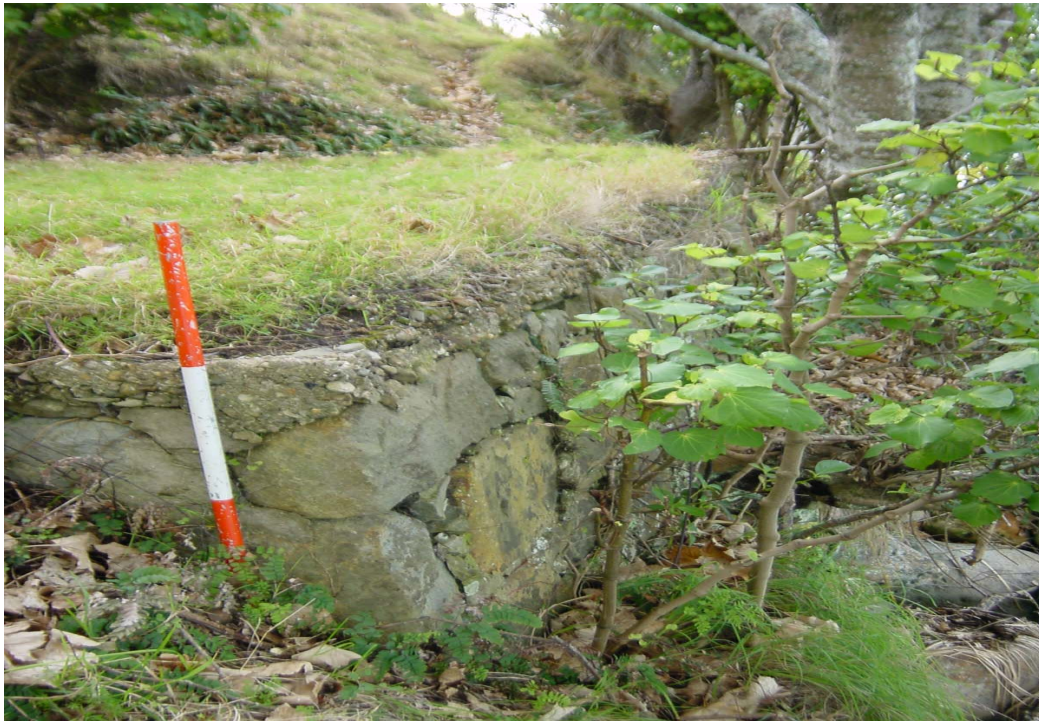
Figure 12. Stone faced landing platform for access to iron jetty.