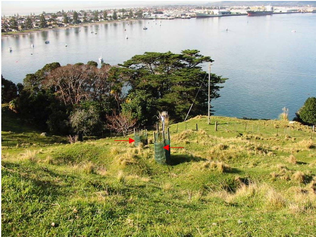
Figure 18. Trees recently planted on occupation terraces.

The current vegetation cover is damaging many archaeological features on the southern spur. The extensive and significant archaeological features on the southern spur would present an impressive sight if they were returned to pasture, unfortunately, vegetation clearance would create a desire line to the summit for more adventurous tourists potentially creating more extensive damage than the current vegetation cover.