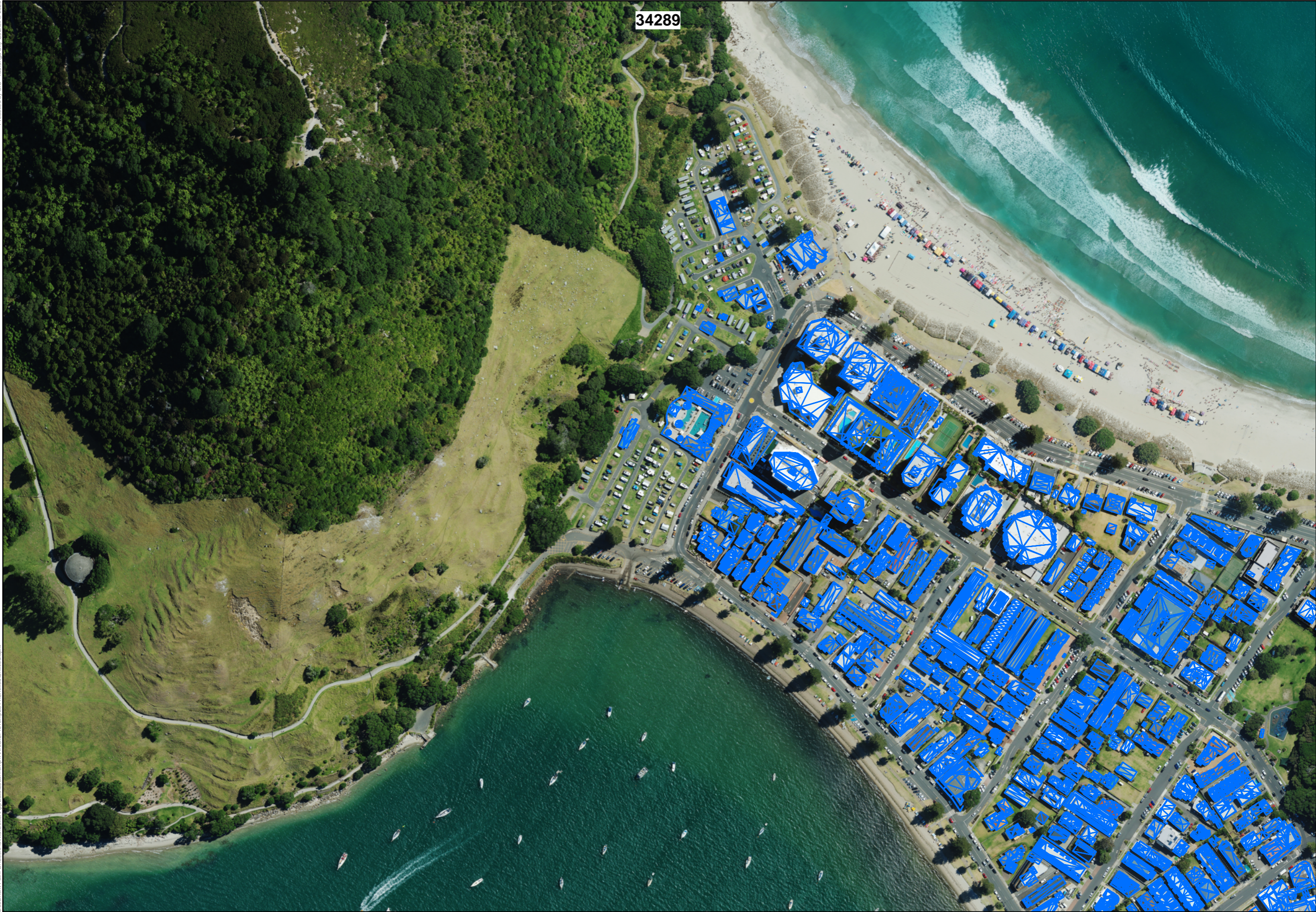
3D building footprint outlines over March 2025 Aerials.