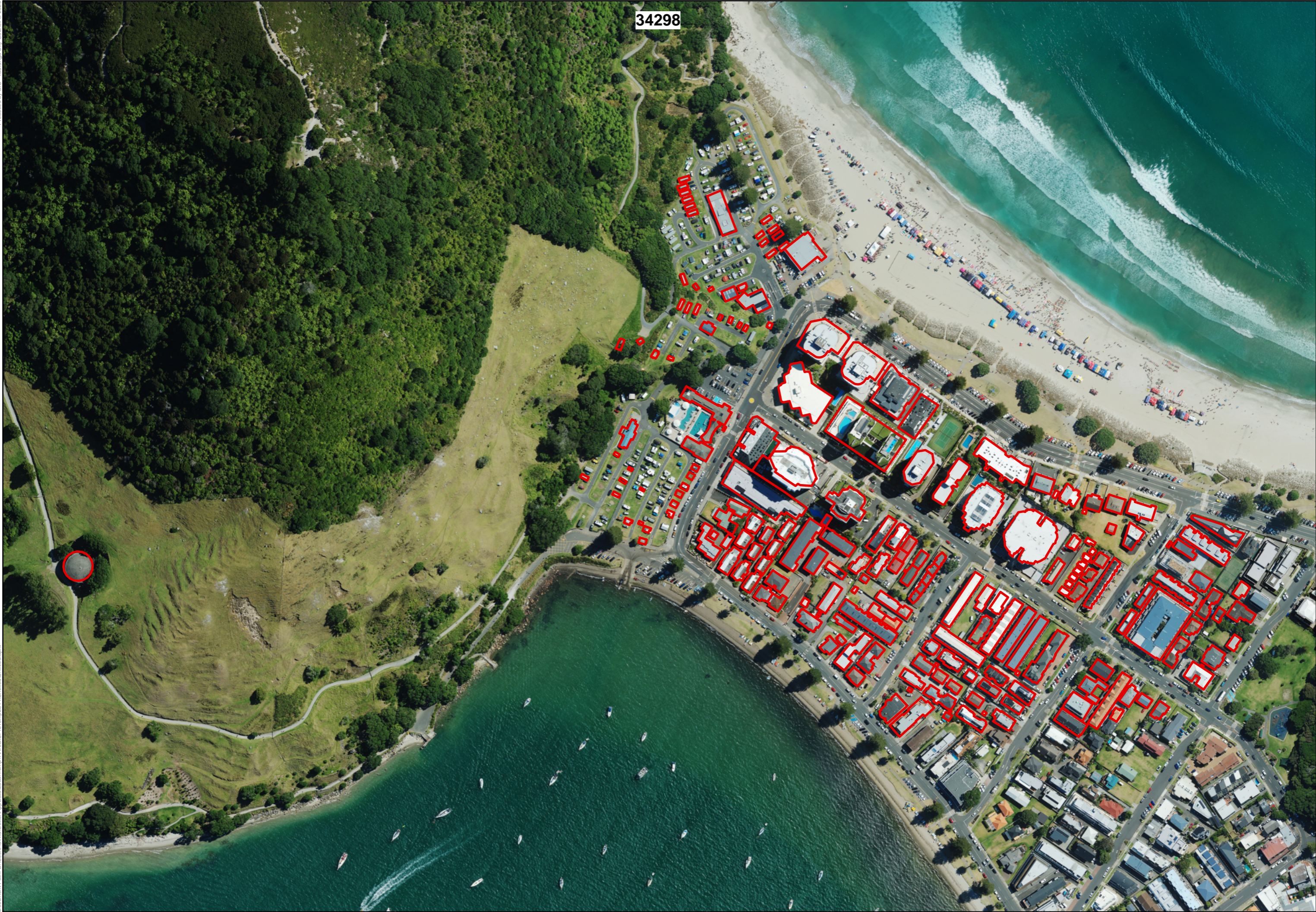
Manual building footprint outlines over March 2025 Aerials.