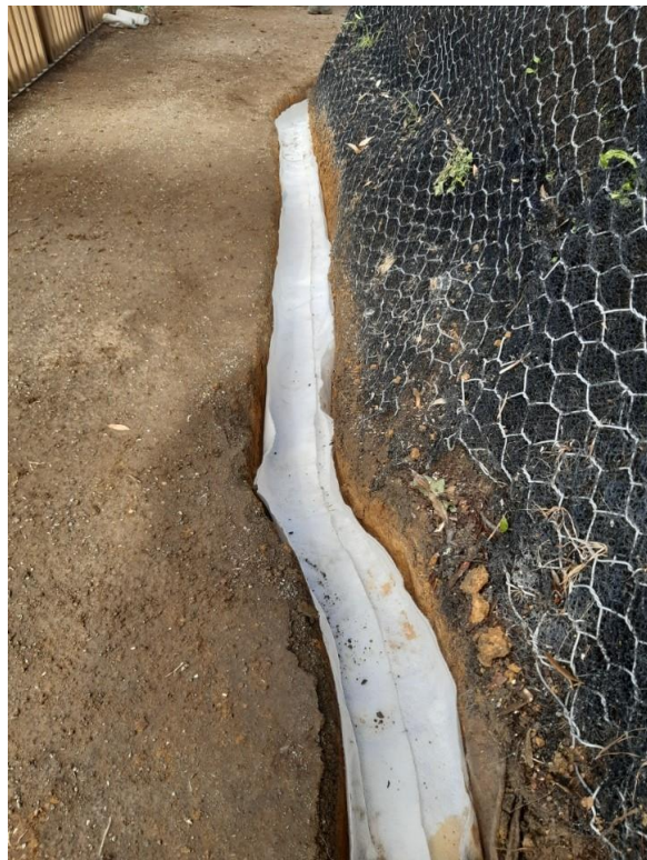
Photograph 19 (top) and Photograph 20 (bottom). Drain install detail below HD03 on 09/11/20