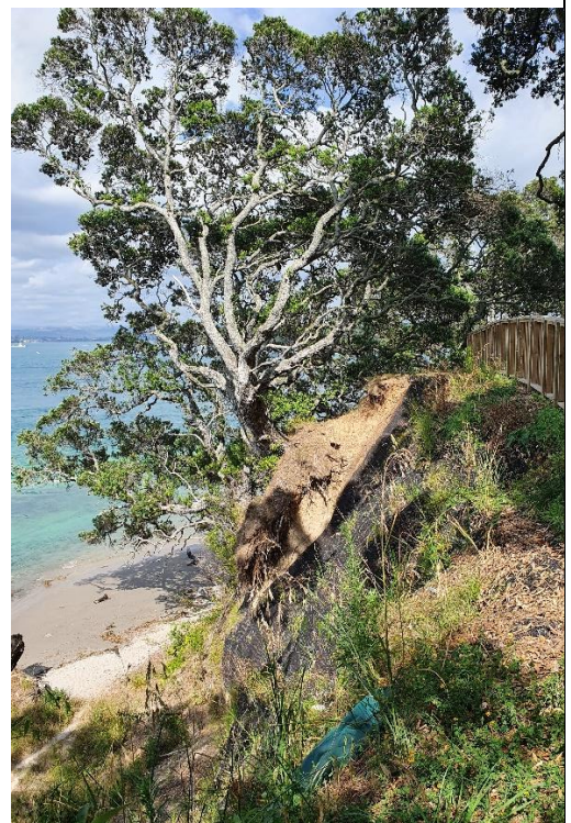
View of slope looking west. Photograph 5 (left) taken on 02/06/20, compared to Photograph 6, taken on 14/01/21.