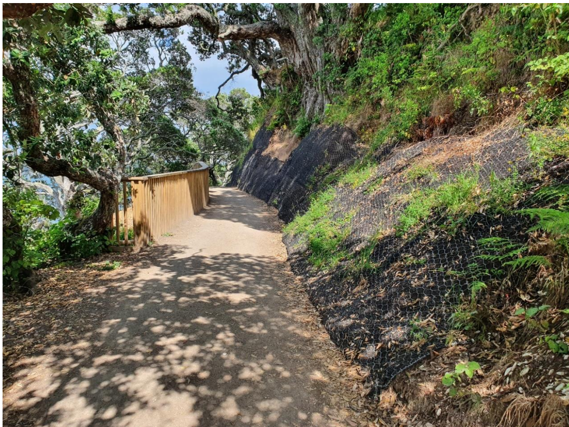
Photograph 1 (top, taken on 02/06/20) compared to the most recent visit on 14/01/21- At the start of the track looking west