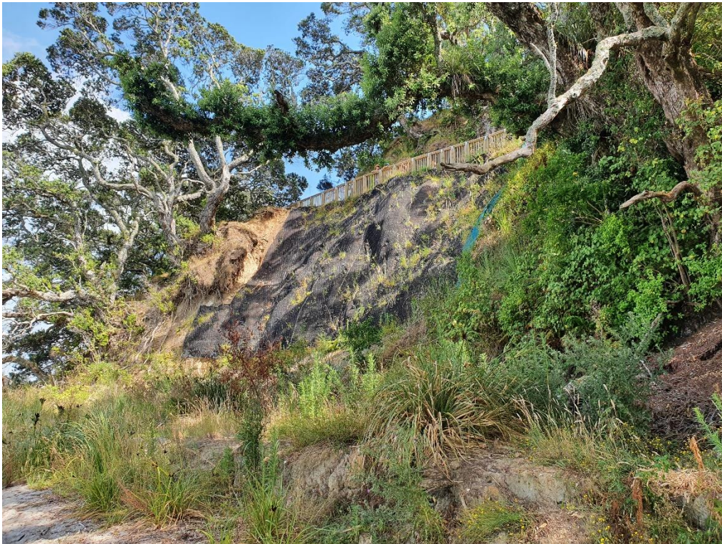
Photograph 17 (top, 01/06/20) and Photograph 18 (bottom, 14/01/21). Looking up to the slip face.