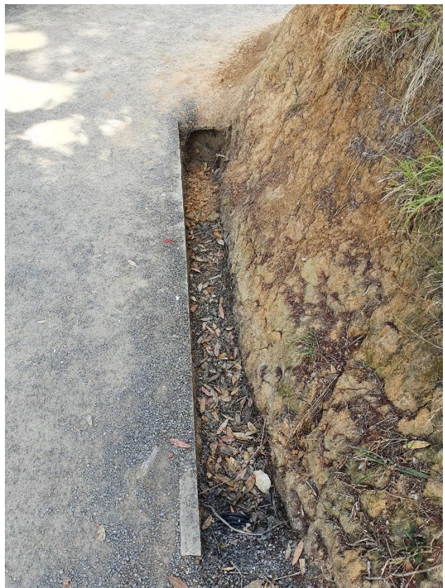
Culvert 02 at west extent of track repair. Photograph 3 (above, left) was taken during the initial inspection on 02/06/20 and Photograph 4 (above, right) taken on 14/01/21.