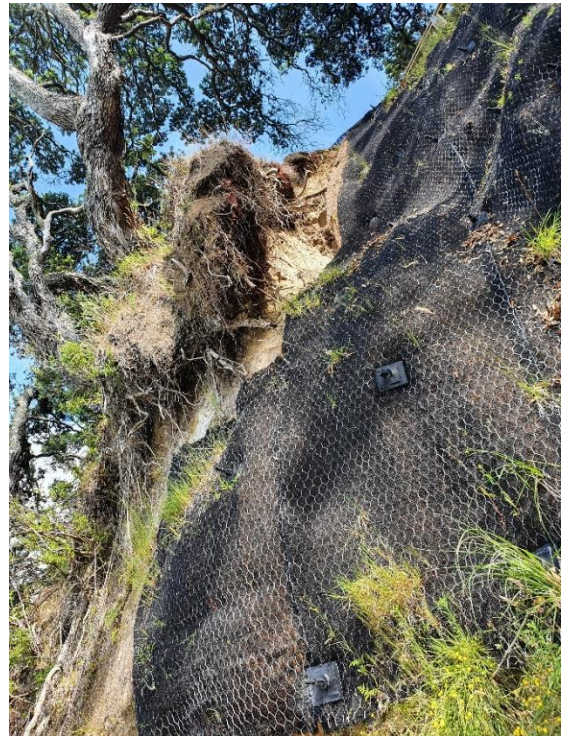
Photograph 7 (top left, taken on 27/08/20) and Photograph 8 (top right, taken on 14/01/21) showing the minor amount of scouring that occurred below horizontal drain 3 during the month of September. Photograph 9 (bottom left) and Photograph 10 (bottom right) show that scour has gradually occurred since the beginning of monitoring to the present.