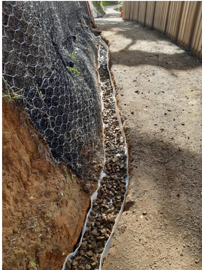
Photograph 21 (top) and Photograph 22 (bottom). Drain install detail below HD03 on 09/11/20