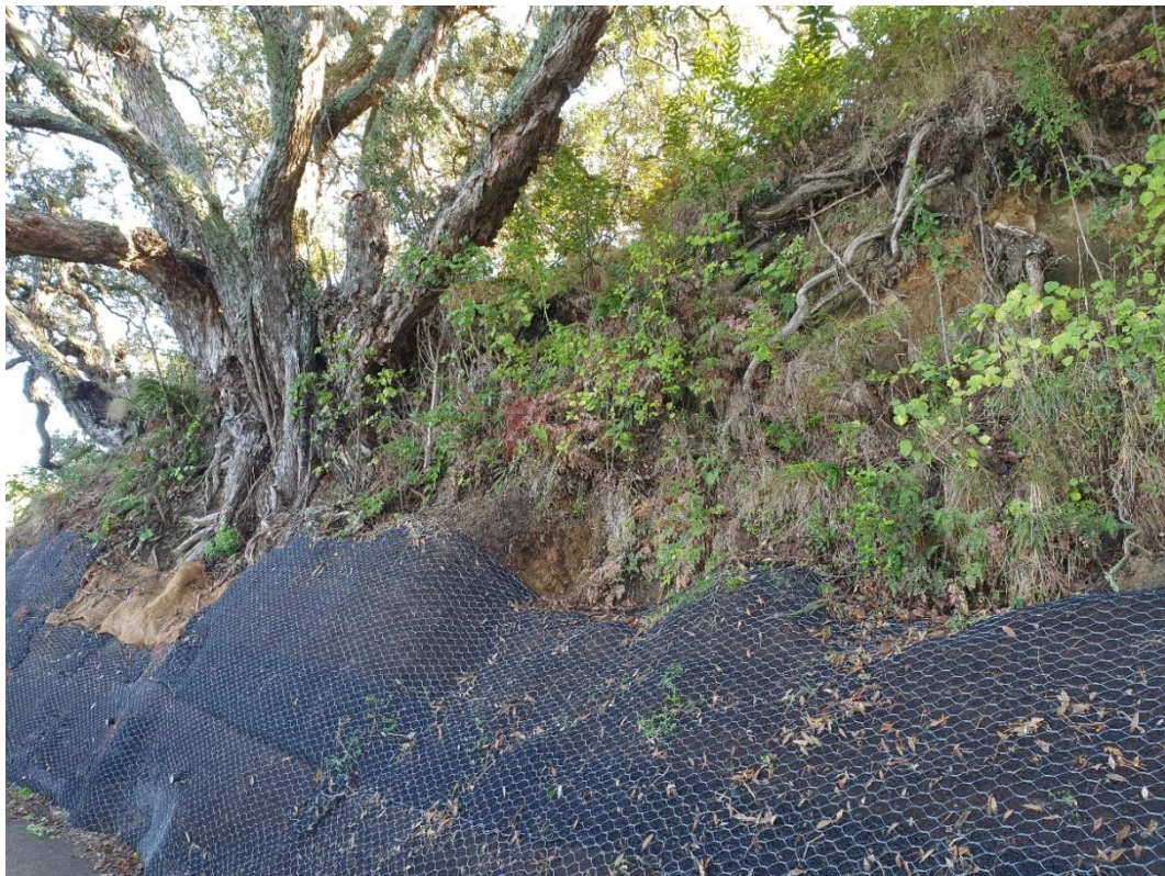
Photograph 13 (top, 02/06/20) and Photograph 14 (bottom, 14/01/21) – slope above track.