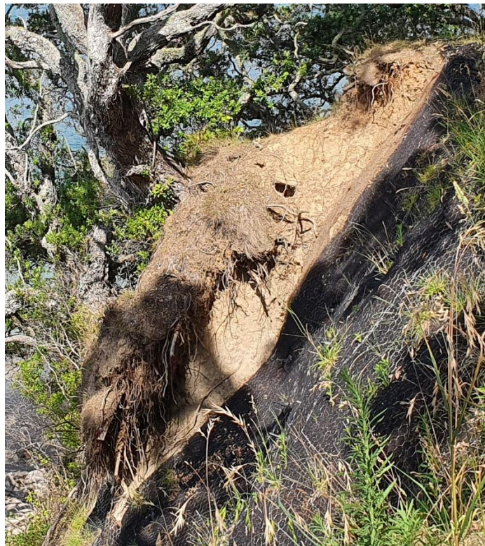
Photograph 11 (top), taken on 02/06/20) and Photograph 12 (bottom, taken on 14/01/21). Looking west across slip face towards the Pohutukawa tree.