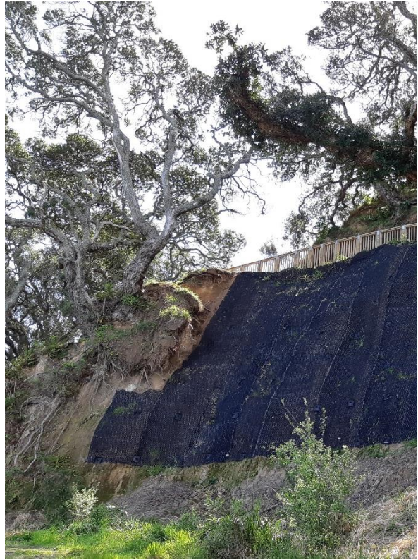
Photograph 14 (left, 02/06/20) and Photograph 15 (28/09/20) - View looking upslope