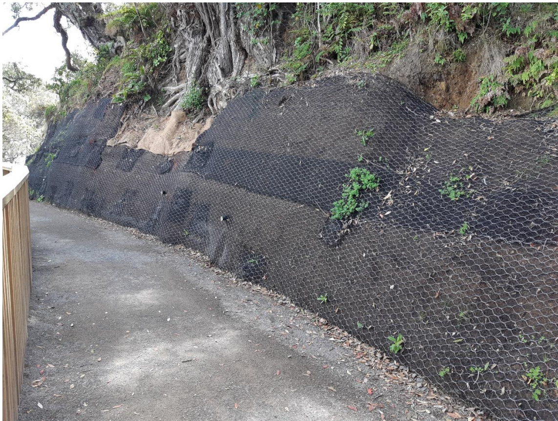
Photograph 18 (top, 02/06/20) and Photograph 19 (bottom, 28/09/20) - slope above track.