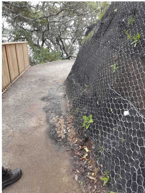
Photograph 7 (top left, taken on 27/08/20) and Photograph 8 (top right, taken on 28/09/20) showing the minor amount of scouring that has occurred below horizontal drain 3 during the month of September. Photograph 9 (bottom) shows the scour looking west from horizontal drain 3 (28/09/20).