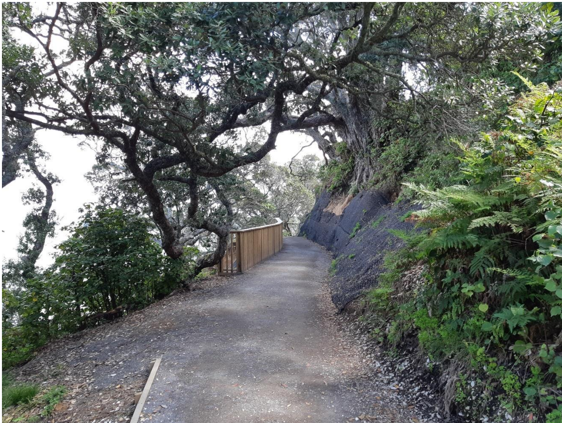
Photograph 1 (top, taken on 02/06/20) compared to the most recent visit on 28/09/20 - At the start of the track looking west