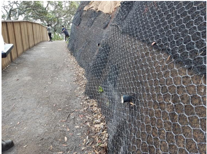
Photograph 10 (top left): Horizontal drain 01. Photograph 11 (top right): Horizontal drain 02. Photograph 12 (bottom left): horizontal drain 03. Photograph 13 (bottom right): looking towards the west end of the repaired track from horizontal drain 01. All photos were taken on 28/09/20.