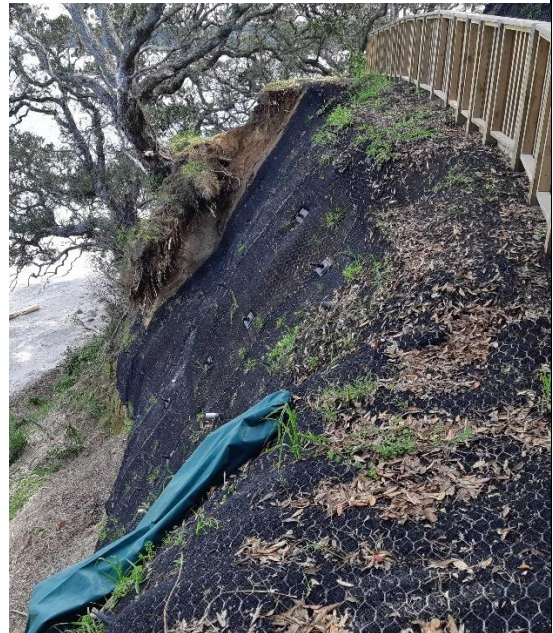
View of slope looking west. Photograph 4 (left) taken on 02/06/20, compared to Photograph 5, taken on 28/09/20.