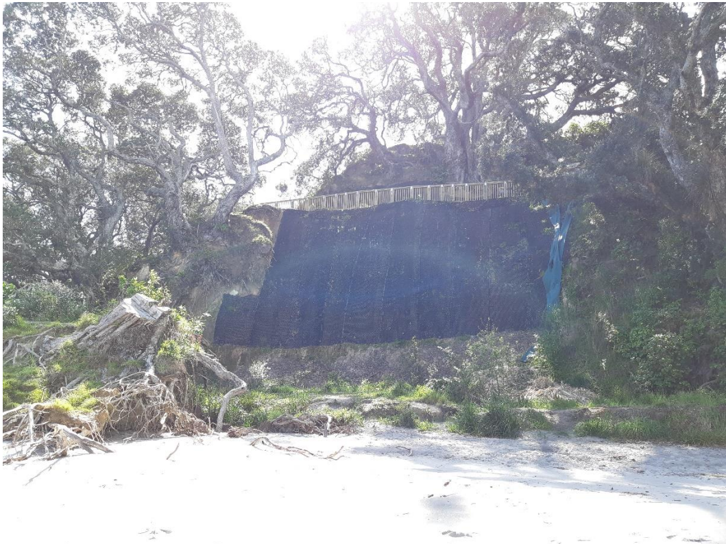
Photograph 22 (top, 01/06/20) and Photograph (bottom, 29/06/20). Looking up to the slip face.