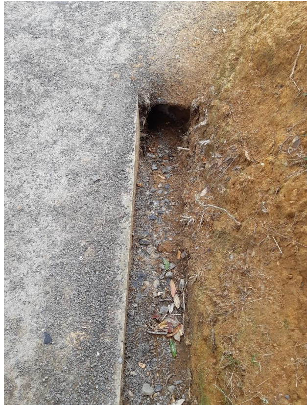
Culvert 02 at west extent of track repair. Photograph 3 (above, left) was taken during the initial inspection on 02/06/20 and Photograph 4 (above, right) taken on 28/09/20.