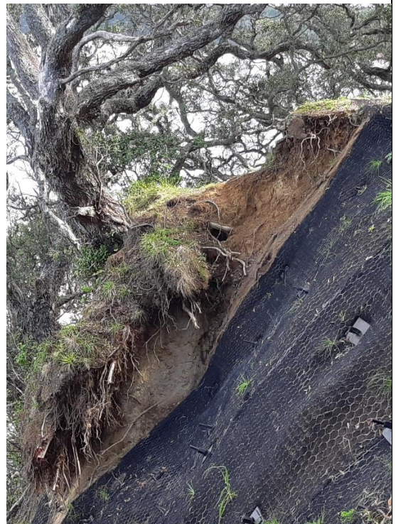
Photograph 16 (left, taken on 02/06/20) and Photograph 17 (right, taken on 28/09/20). Looking west across slip face towards the Pohutukawa tree.