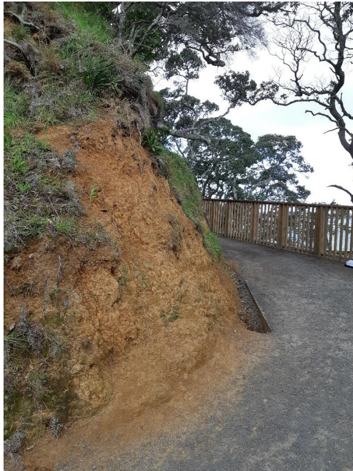
Photograph 20 (top, 02/06/20) and Photograph 21 (bottom, 28/09/20). Looking towards the track from the western end.