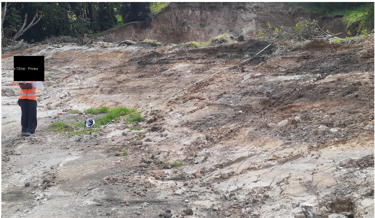
Figure 5. Photograph showing the batter slope excavated through the landslide debris during recovery efforts which provides an insight into the soil units within the failure. The main slip scarp can be seen in the upper background of the image.