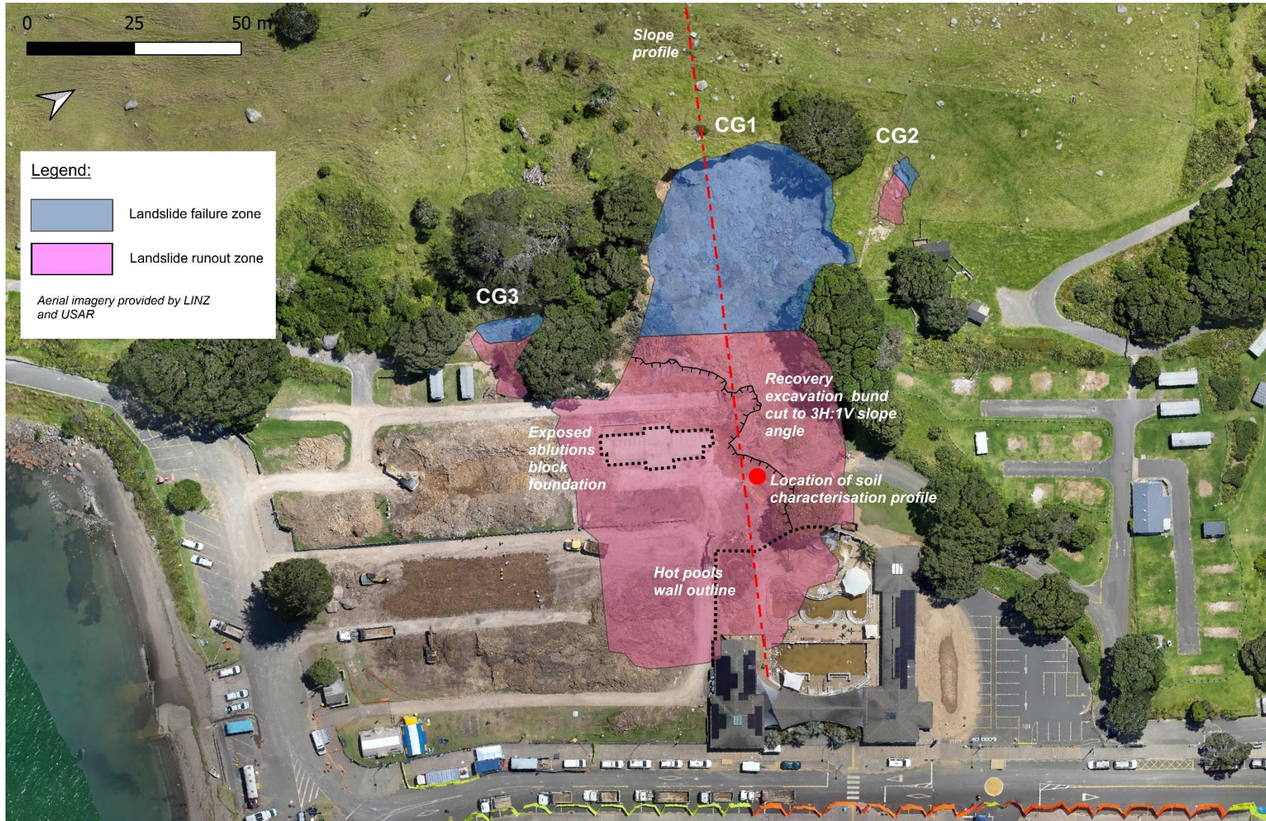
Figure 1. Site plan showing location of landslides that occurred on 22 January 2026 within the Harbour Side of the Holiday Park. Adapted from LINZ and USAR aerial imagery (dated 30 Jan 2026).