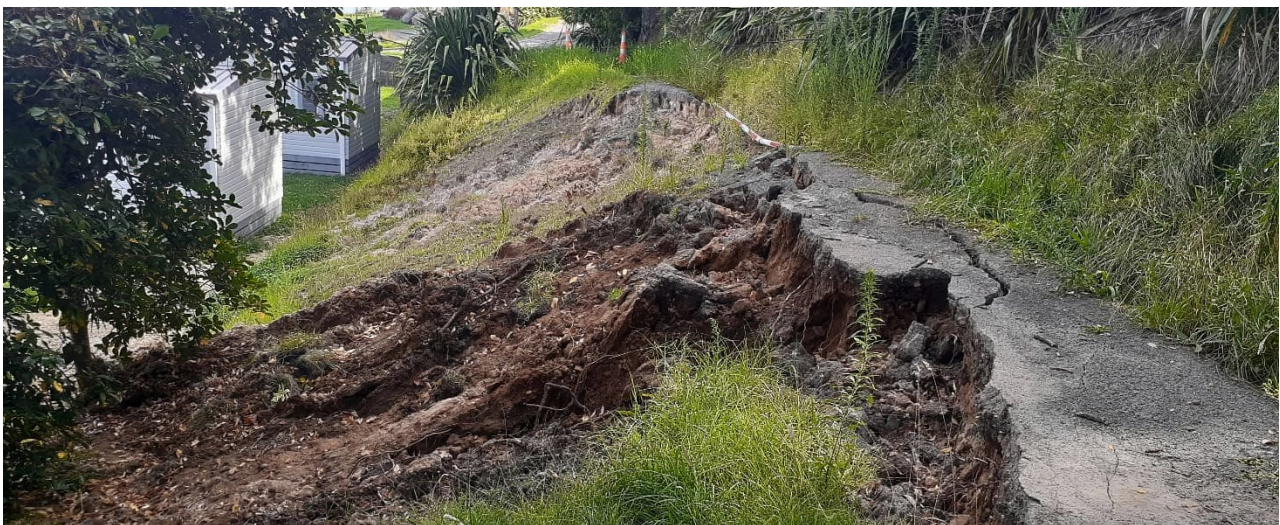
Figure 4. Photograph of CG3 slump looking southwest.