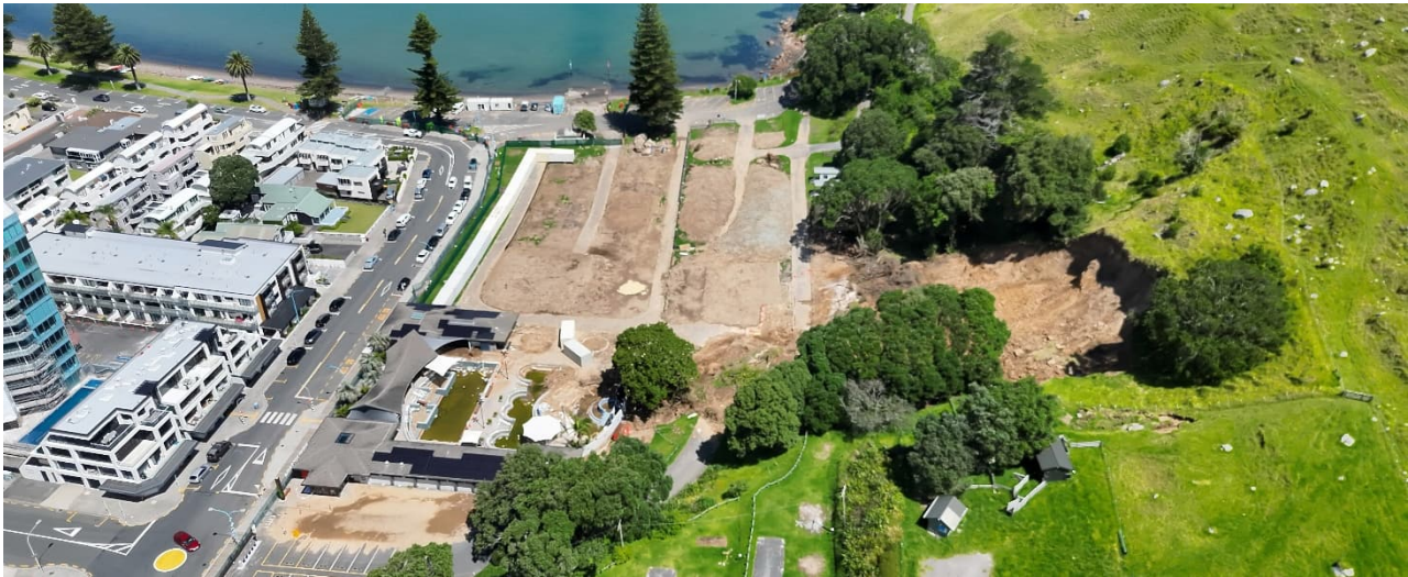
Figure 2. Aerial UAV photograph of the main slip CG1 looking south.