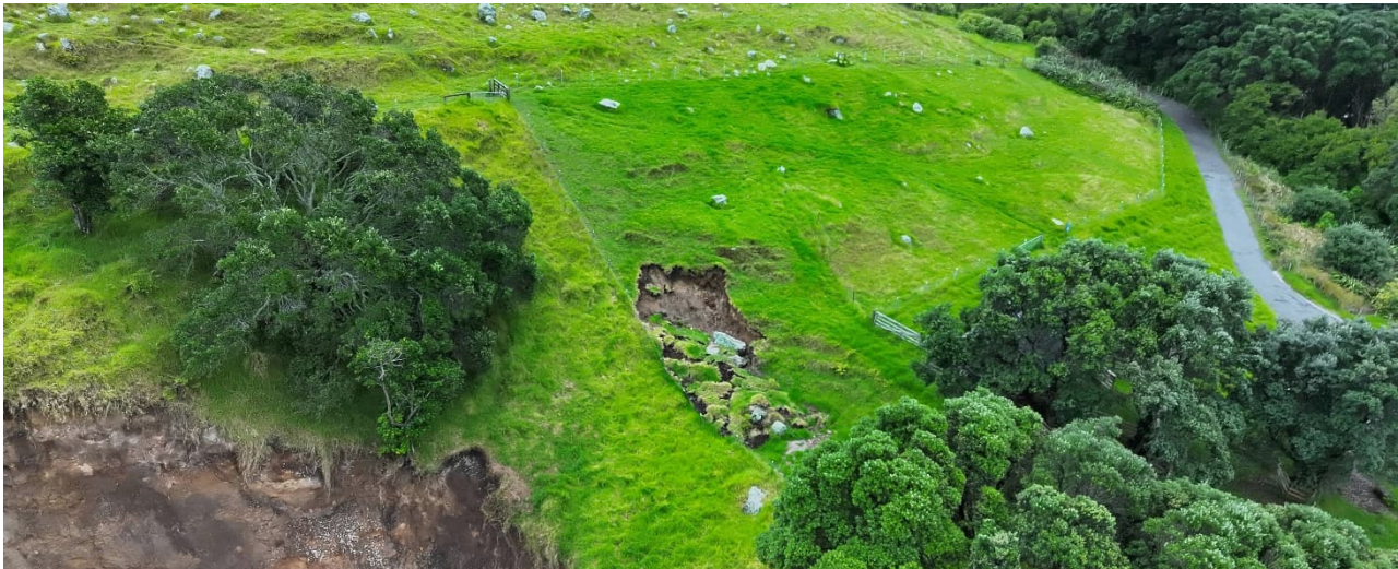
Figure 3. Aerial UAV photograph of CG2 looking north. Main slip in lower left of image.